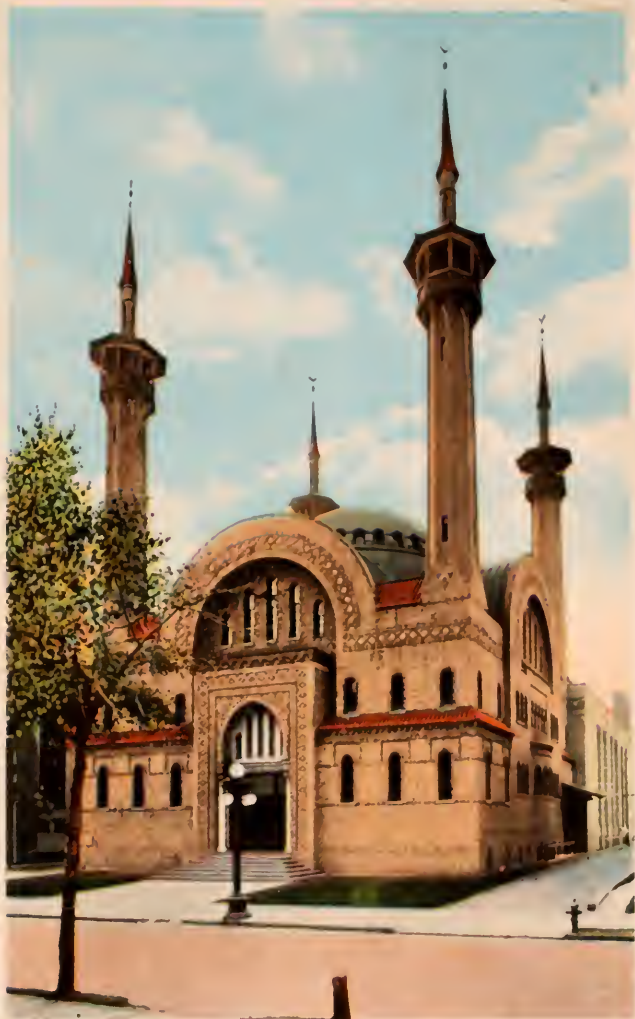
IREM TEMPLE, WILKES-BARRE, PA.